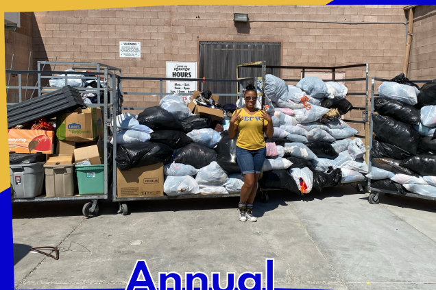
Annual Clothing Drive

Through our Annual Clothing Drive we were able to raise $400 towards our scholarship efforts with the help of our community. Thank you all so much for your support.