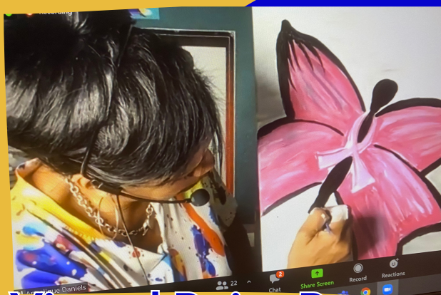
Virtual Paint Party